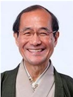
Daisaku Kadokawa Mayor of Kyoto City