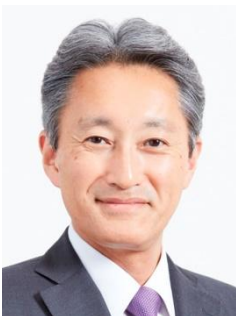
Kazuo Hirai Chairman, Sony Corporation