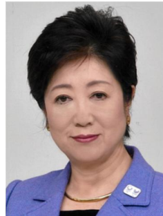
Yuriko Koike Governor of Tokyo