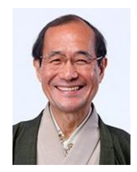
Daisaku Kadokawa Mayor of Kyoto City