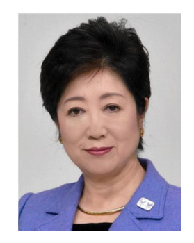
Yuriko Koike Governor of Tokyo